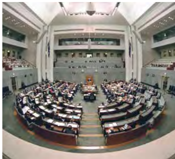
The House of Representatives

Members of Parliament and senators debate proposals for new laws in the Australian Parliament. The role of the House of Representatives is to consider, debate, and vote on proposals for new laws or changes to the laws, and discuss matters of national importance.