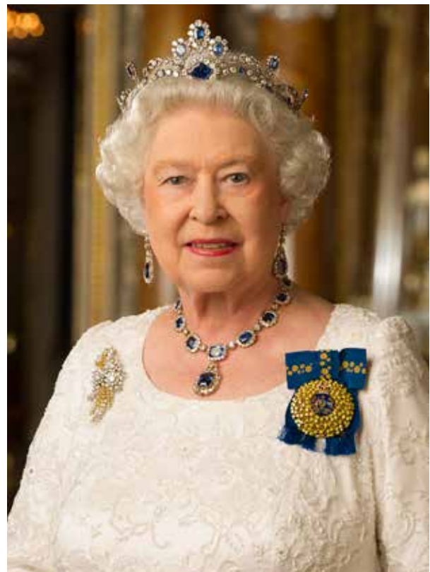
Her Majesty Queen Elizabeth II

The Australian system of parliamentary democracy reflects British and North American traditions combined in a way that is uniquely Australian. In the Australian system, the leader of the Australian Government is the Prime Minister.