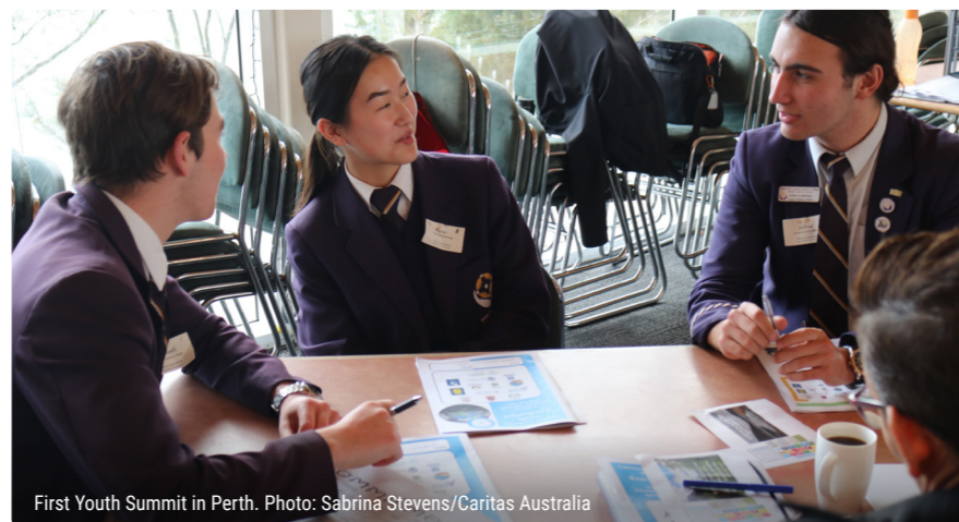
First Youth Summit in Perth.