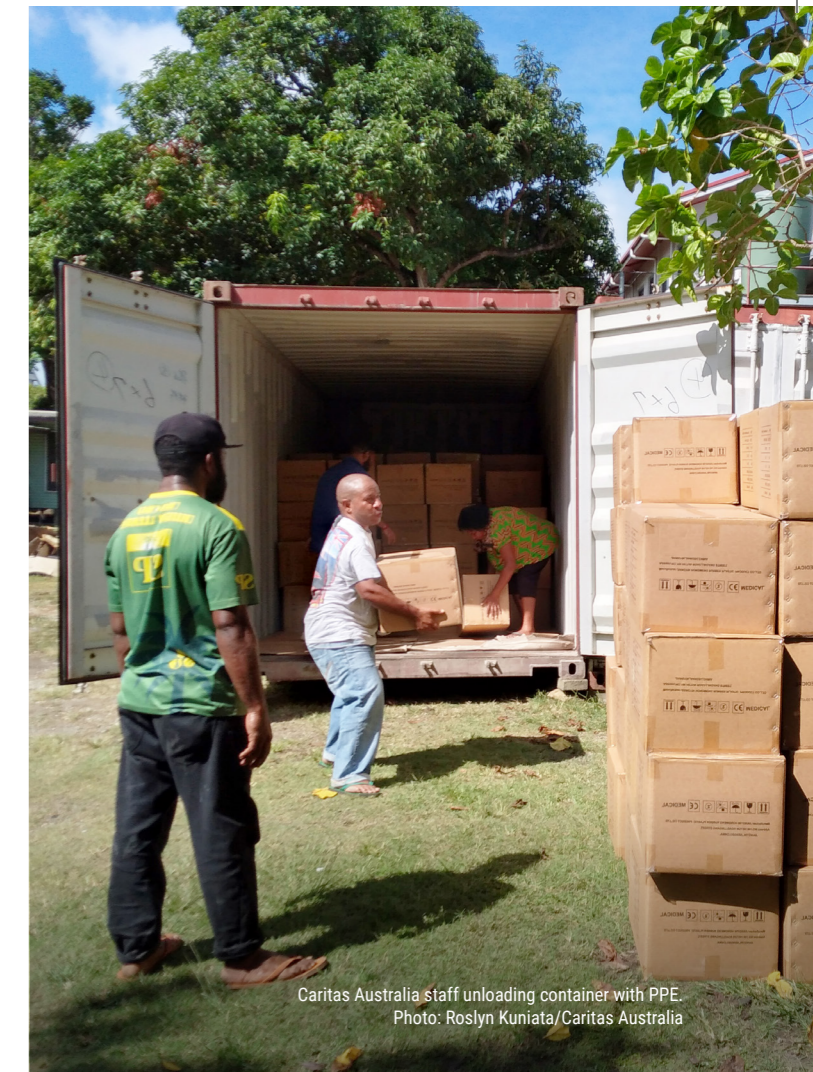
Caritas Australia staff unloading container with PPE.

With the resources that were given, health workers were able to continue serving their communities, whilst other Dioceses kept the PPEs and issued them on a needs basis, with the concern of a potential second wave of COVID-19.