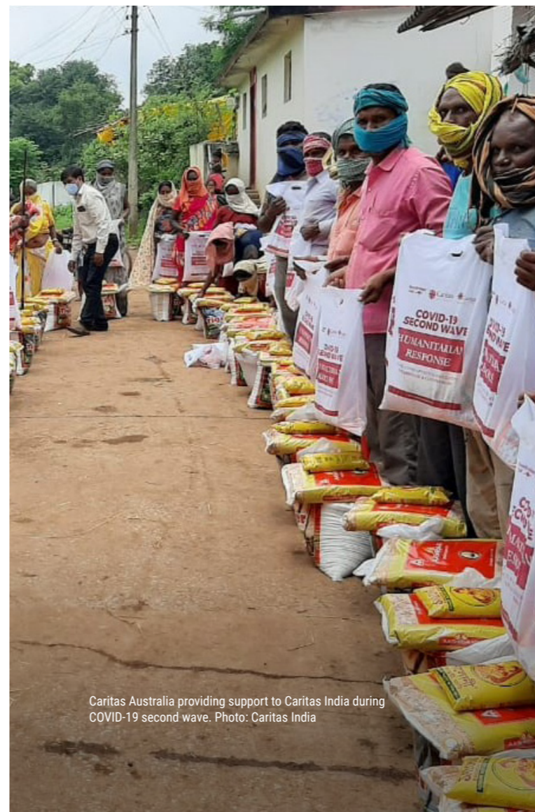
Caritas Australia providing support to Caritas India during COVID-19 second wave.

Caritas India, with the support from Caritas Australia, assisted the most vulnerable families residing in the Gram Nirman project villages. In consultation with existing community organisations, 2476 families were identified and provided with dry ration kits. Each kit included 20kg rice, 5kg wheat flour, edible oil, lentils, and salt which was sufficient for approximately 20 days for an average family of five people.