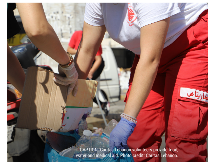
CAPTION: Caritas Lebanon volunteers provide food, water and medical aid.

To provide support to Lebanon, please donate to the Caritas Australia Middle East Regional Appeal at www.caritas.org.au/donate/emergency-appeals/middle-east/