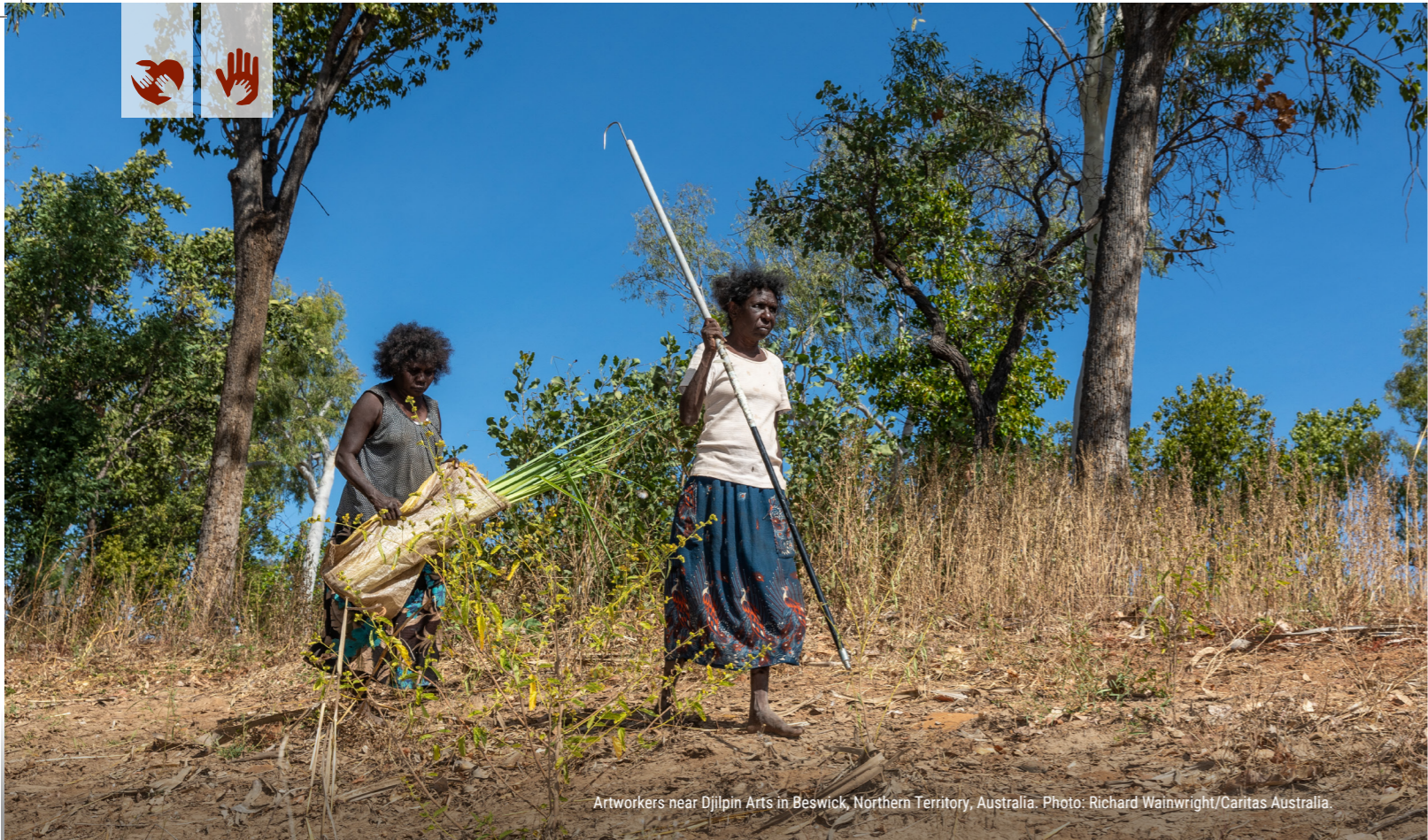
Artworkers near Djilpin Arts in Beswick, Northern Territory, Australia.