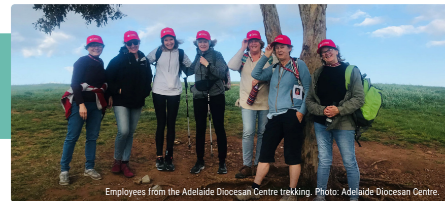
Employees from the Adelaide Diocesan Centre trekking.

Finally, we need to support family reunion applications for Afghan Australians' whose families are in grave danger. We need to show compassion and solidarity towards the Afghan people.